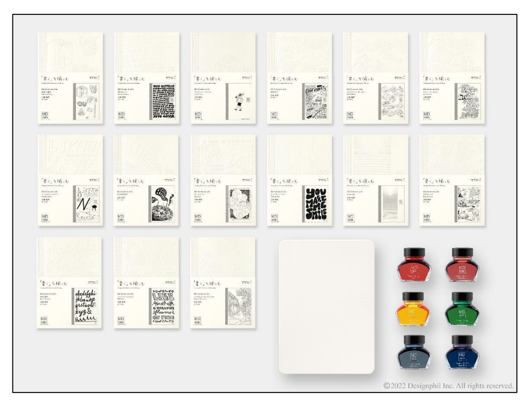
MD PAPER PRODUCTS™ 15th Anniversary Limited-edition Items

(All prices listed are suggested retail prices.)