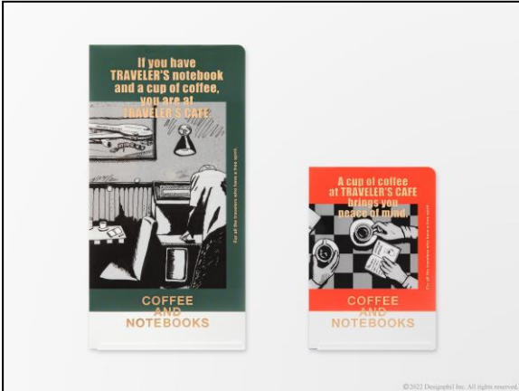
Clear Folder 2023

The Customized Sticker Set for Diary will help you get creative when making your diary uniquely your own. A wide range of stickers are included in this six-sheet set, such as indexes, pockets, scheduling icons and lettering, as well as stickers to decorate your front cover. The 2023 version features a design with a theme of "TRAVELER'S CAFE". You can customize the cover of 2023 dairy with stickers that are designed as TRAVELER'S CAFE tools or coffee cans.