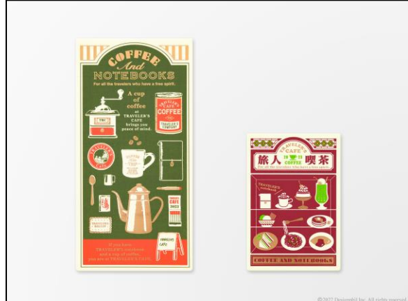
Plastic Sheet 2023