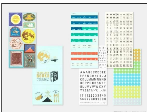
Customized Sticker Set for 2021 Diary