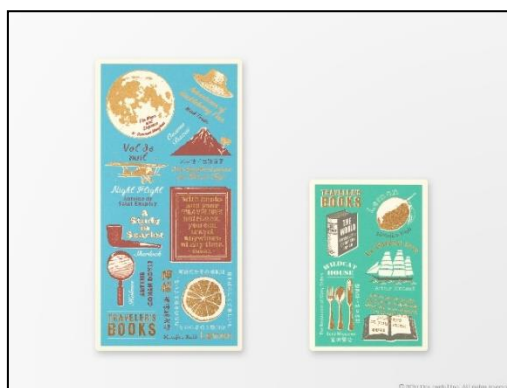
Plastic Sheet 2021