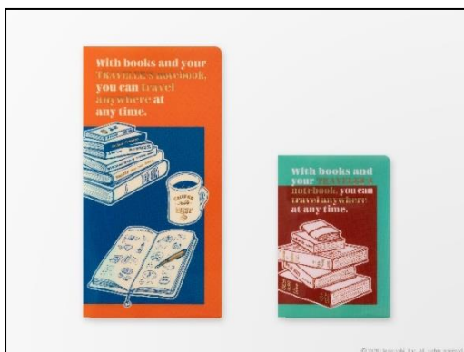
Clear Folder 2021

The Customized Sticker Set for Diary will help you get creative when making your diary uniquely your own. A wide range of stickers are included in this six-sheet set, such as indexes, pockets, scheduling icons and lettering, as well as stickers to decorate your front cover. In keeping with the 2021 theme of books, the stickers for customizing the cover feature designs that incorporate literary works from all over the world that evoke the feeling of traveling, including The Adventures of Huckleberry Finn by Mark Twain, Night Flight by Antoine de Saint-Exupéry, The Moon and Sixpence by W. Somerset Maugham and Lemon by Motojiro Kajii. These masterpieces from around the globe will adorn your travels in 2021.