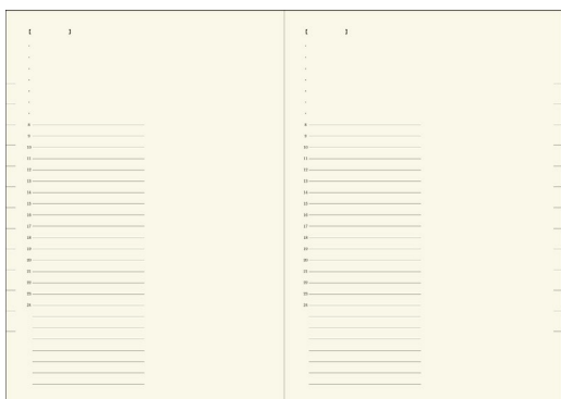
MD Notebook Diary 1 Day 1 Page Monthly scheduling pages (for December 2018through January 2020) + A free page for each day (385 days)