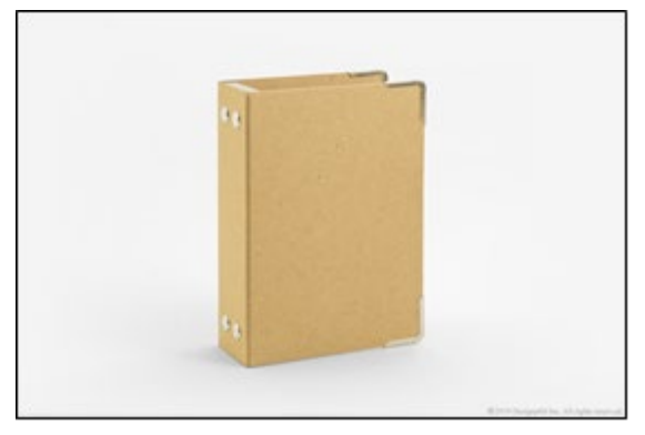
This binder holds 5 Passport Size Refill volumes!