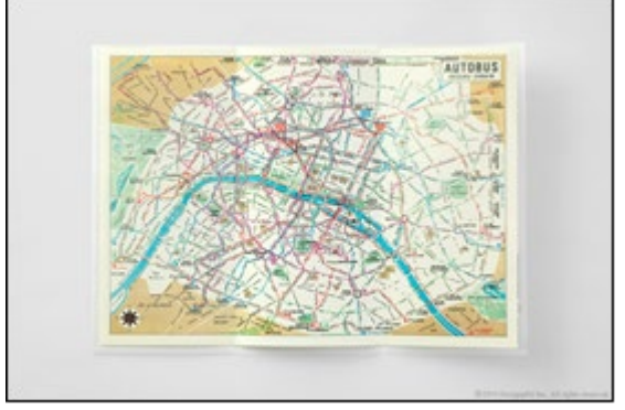
Use "Three-fold File" to keep ticket printouts and maps when you travel.