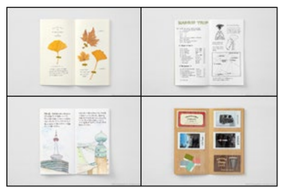
Introducing new refills for even greater enjoyment!

*All prices listed are recommended retail prices