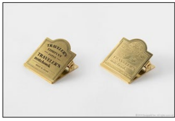
"TRAVELER'S notebook Brass Clip" for taking photos of your notebook or using it for decoration.