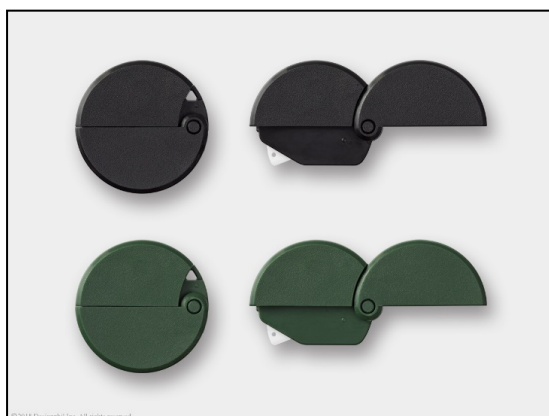
MIDORI Carton Opener