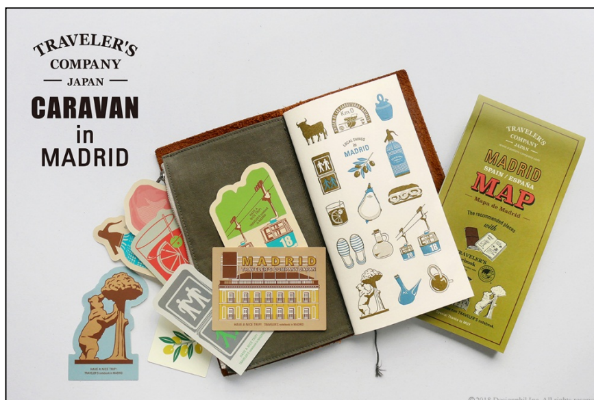
The event will feature limited-edition items designed with motifs of things you can see in Madrid, including traffic lights, gondolas and the Bear and the Strawberry Tree statue!

Fun TRAVELER'S notebook events and exhibitions will also be held. Events include a stamp tour in which users who visit three of the six stores will receive a free gift of original stickers, and a TRAVELER'S COMPANY Madrid Map with recommended spots to visit with your TRAVELER'S notebook. The exhibitions, meanwhile, will feature art that the Spanish artists have drawn in their TRAVELER'S notebooks and TRAVELER'S notebooks that users have submitted to exhibit in the stores.