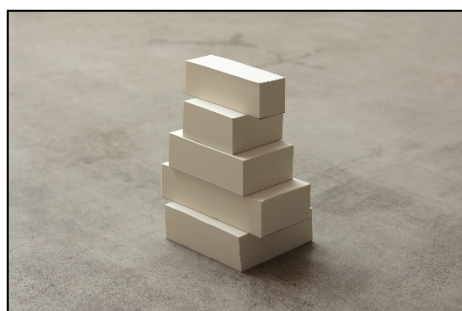
MD paper sold by weight