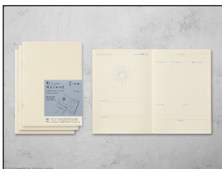
Special edition product created through a collaboration between MD PAPER PRODUCTS and Chronodex