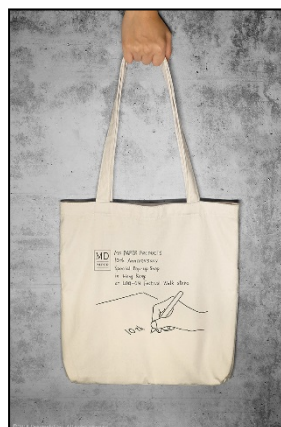
Original tote bag with the event logo