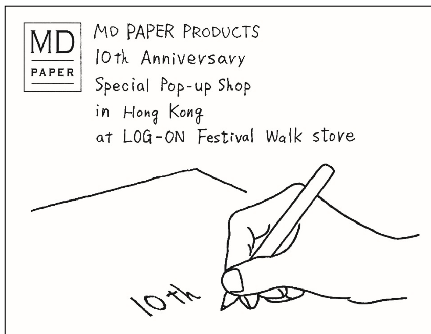
MD PAPER PRODUCTS 10th Anniversary Special Pop-up Shop in Hong Kong at LOG-ON Festival Walk

All visitors upon purchase any MD PAPER PRODUCTS over 300HKD can enjoy an original tote bag with the event logo as a free gift. (Limit to 300pcs)