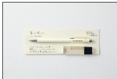
Event-only Knock Pencil