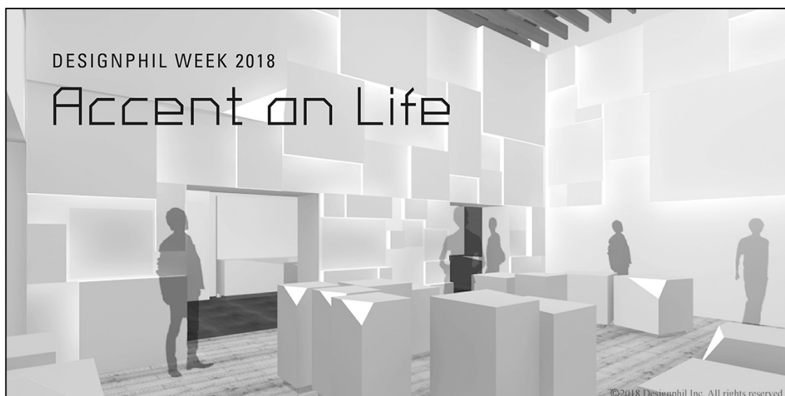
DESIGNPHIL WEEK 2018: DESIGNPHIL's first private show for general customers!

As a prelude to the event, a MIDORI Corner will be set up on the stationery floor of DAIKANYAMA T-SITE from June 20 (Wed) to July 19 (Thu). During the event, the MIDORI Corner will sell some of the MD notebooks with a limited-edition pattern that will be made in the event venue.