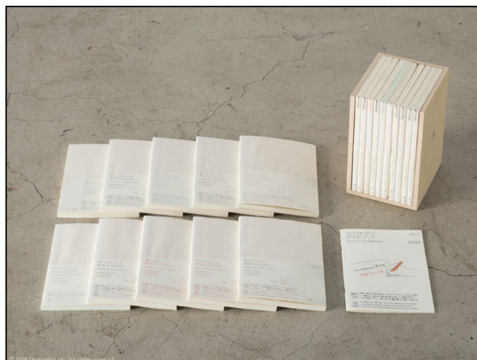
The limited-edition products being released to celebrate the 10th anniversary of MD Paper Products™

The range of A5 size notebooks includes Dot Grid (5mm apart for text and diagrams), Sketch Journal (an unruled format based on the format used for research notes), Lined with Sections (7mm-wide sections on two-page spreads with orange borders, enabling use as a weekly diary), Storyboard (16 frames on two-page spreads), Graph Paper (1mm grid providing an unobtrusive guide), White Grid (5mm grid with faint lines that the user will find themselves unconsciously following with their pen), Lined with Margin (a new style with 7mm ruling and adjacent blank space), Grid with Margin (a new style of 5mm grid enabling free writing of ideas or to-do lists), Oversized Grid (a Japanese writing grid with spaces for 600 characters on two-page spreads) and Vertical Lines (with 9mm lines for easy writing in languages with vertical writing such as Japanese.) This variety of different ruling types provides an even wider range of support as you put your thoughts on paper.