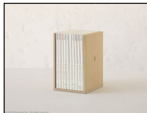
10th Anniversary Notebook Set

A special set containing all 10 of the MD Notebook 10th products is also available in a dedicated case (¥9,000 + tax).