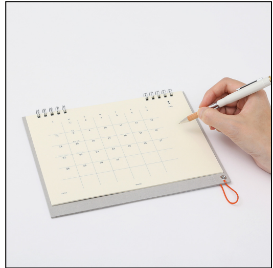
Fold it down flat for easy writing