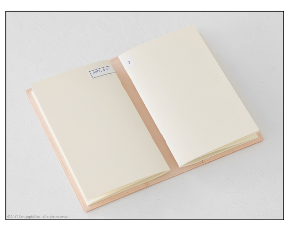
The "MD Goat Leather Cover "can hold 2 books