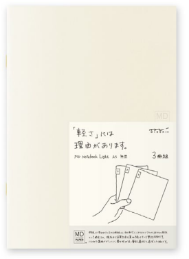
Product packaging *Image shows an A5 size/Blank