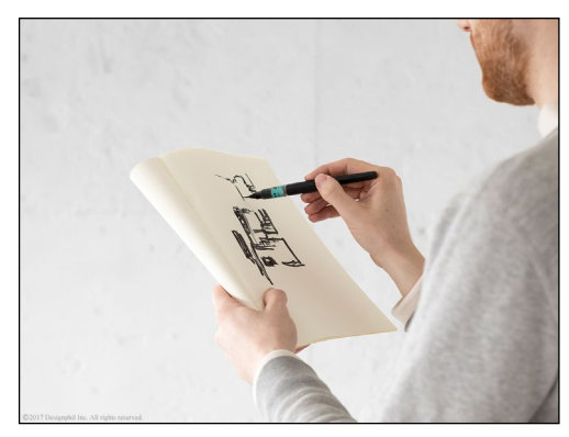
Easily use an A4 Variant as well!