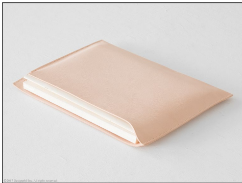
The horizontal type is simply designed just to carry notebooks