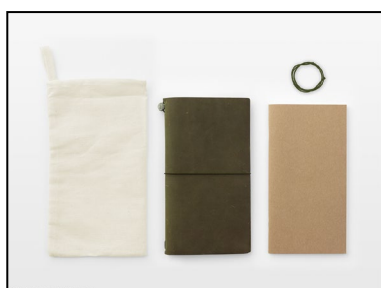
TRAVELER'S notebook OLIVE EDITION

Painted in an olive color, “BRASS BALLPOINT PEN” features a cord and clip. With the adjustable cord length, the pen can be worn around the neck or attached to a bag. This makes it easy to carry around when outdoors or on a trip. The clip can also be removed from the pen.