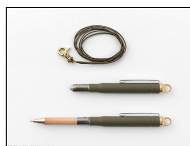
BRASS BALLPOINT PEN OLIVE EDITION