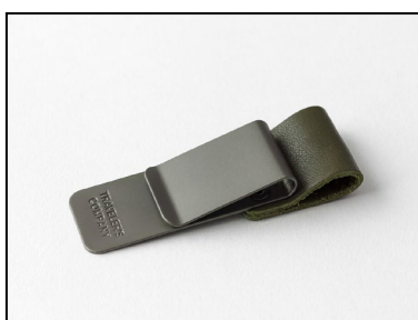
PEN HOLDER<M> OLIVE EDITION