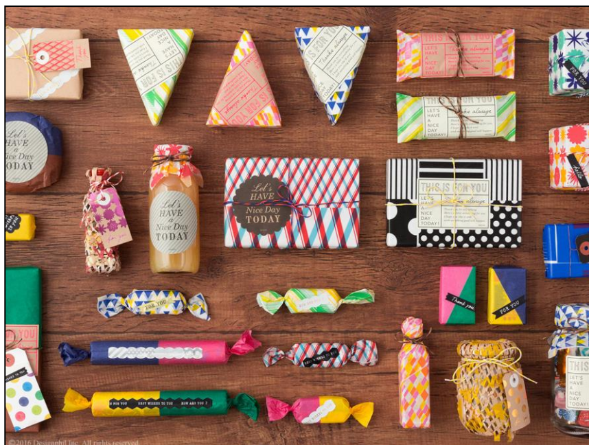
“Chotto” – The little things that make something special Having a small (Chotto) celebration to mark a special day... It's the little (Chotto) things that make something special and show how you feel.

“Chotto,” the name of the new range, is a Japanese word with lots of meanings. It can mean “little” or “slight,” “casually” or “simply.” Whether you're wrapping a little gift or present, throwing a casual party at home, or having a small celebration to mark a special day... It's the little (chotto) things that make something special and show how you feel.