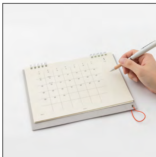
Fold it down flat for easy writing