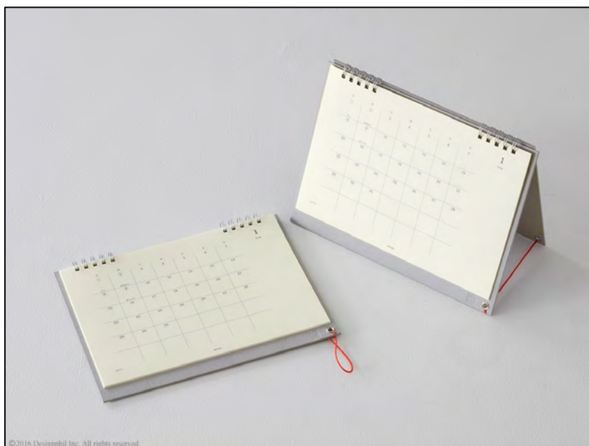
Recreating the “MD Notebook Diary” in Calendar form!

With a layout optimized for users who want to write things down just as they want, the Calendar stimulates each user’s creativity.