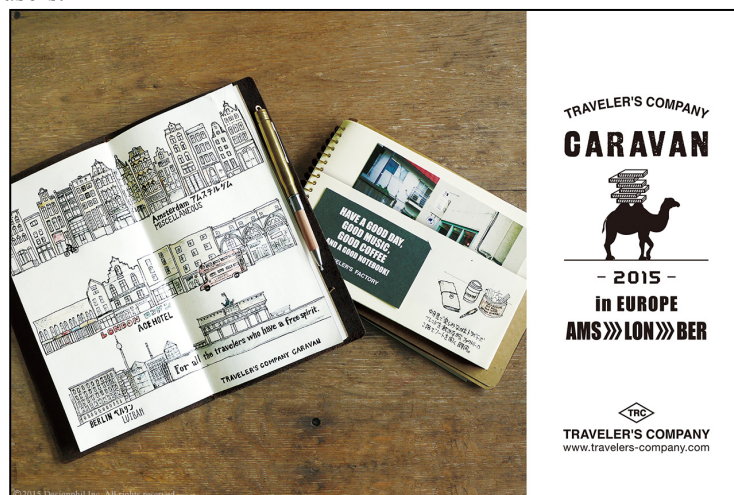
The first caravan event in Europe!

The producers and designer from TRAVELER'S COMPANY will be flying to Europe to exchange information with other notebook users.