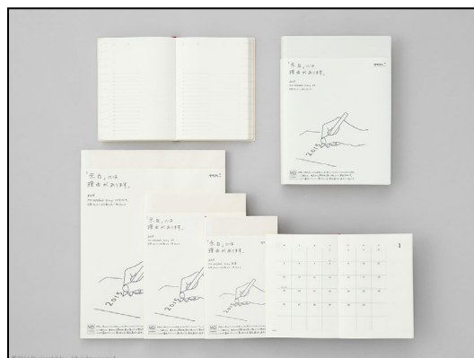
Simple and easy-to-use diaries stimulating the creativity of the user

(*) All the prices shown here are suggested retail prices.