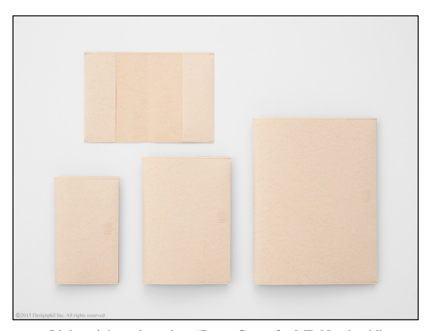
Lightweight and sturdy – "Paper Cover for MD Notebook"

To go on sale soon, "Paper Cover for MD Notebook" is made of a special type of paper named Cordoba, which is tough and lightweight, so you can enjoy all the comfort of writing on a MD Notebook with a jacket on it. The jackets come in a natural hue, with some "wrinkles" on them, which create a very natural and appreciative feeling. The jackets are designed to convey all the raw and natural pleasures of the material, Cordoba.