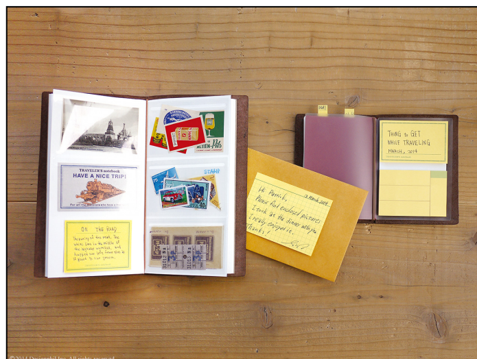
New refill items to "TRAVELER'S notebook"!

(*) The prices shown are all suggested retail prices.