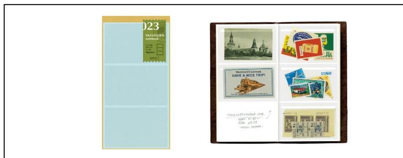
“Film Pocket Sticker”