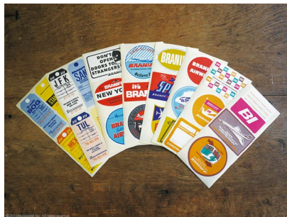
Paste “Sticker” for fun, as if putting on your suitcase.