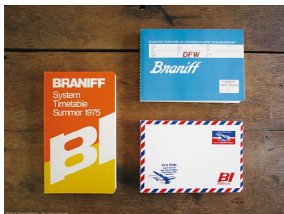
“Spiral Ring Notebook” printed with the choicest printing technology and style