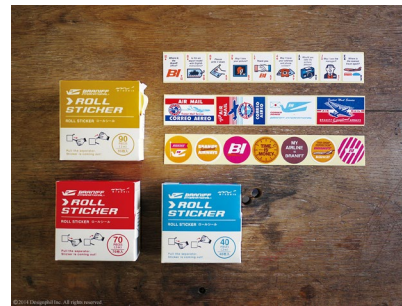
“Roll Sticker” with a large number of stickers