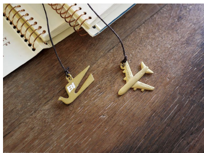
“Charm” ideal for bookmark and key holder