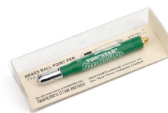
“TRAVELER’S notebook Charm Brass Plate TRAVELER’S STAR EDITION”, “TRAVELER’S notebook Charm Life Buoy TRAVELER’S STAR EDITION”, “TRAVELER’S notebook Brass Clips TRAVELER’S STAR EDITION”, “TRAVELER’S notebook Brass Ball Point Pen TRAVELER’S STAR EDITION”